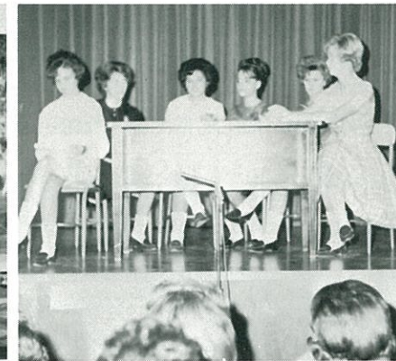
Panel on Ready