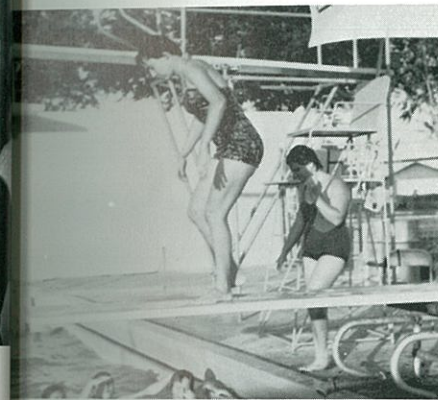
Come on in, the water's fine