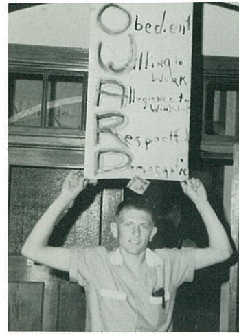
That's What the Veep Said