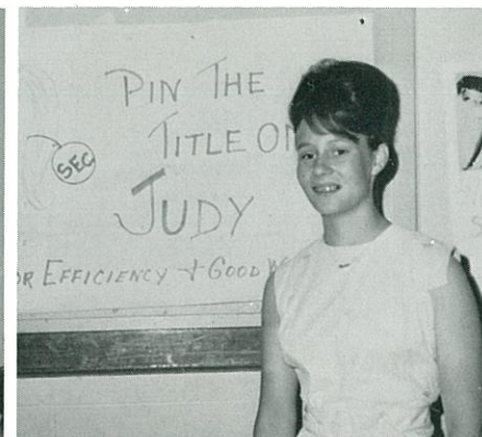
We Followed Instructions